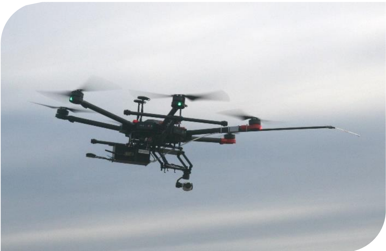
Explicit's mini sniffer system mounted on a drone.

The current solutions for remote monitoring of sulfur emissions include fixed measuring stations analyzing drifting plumes from ships passing the monitoring point (such as the one installed on the Great Belt Bridge in Denmark and at entry ways to key European ports) or airborne surveillance using gas analyzer equipment like the solution developed by Explicit mounted on either a manned helicopter, plane or drone. The advantage of airborne surveillance over fixed stations is the ability to navigate the aircraft close to each exhaust plume and obtain a better quality air sample. Additionally, airborne surveillance covers larger geographical areas and allows for surprise inspections to better enforce compliance. In the following, we focus on the comparison of mounting a gas analyzer on a helicopter vis-à-vis a drone.