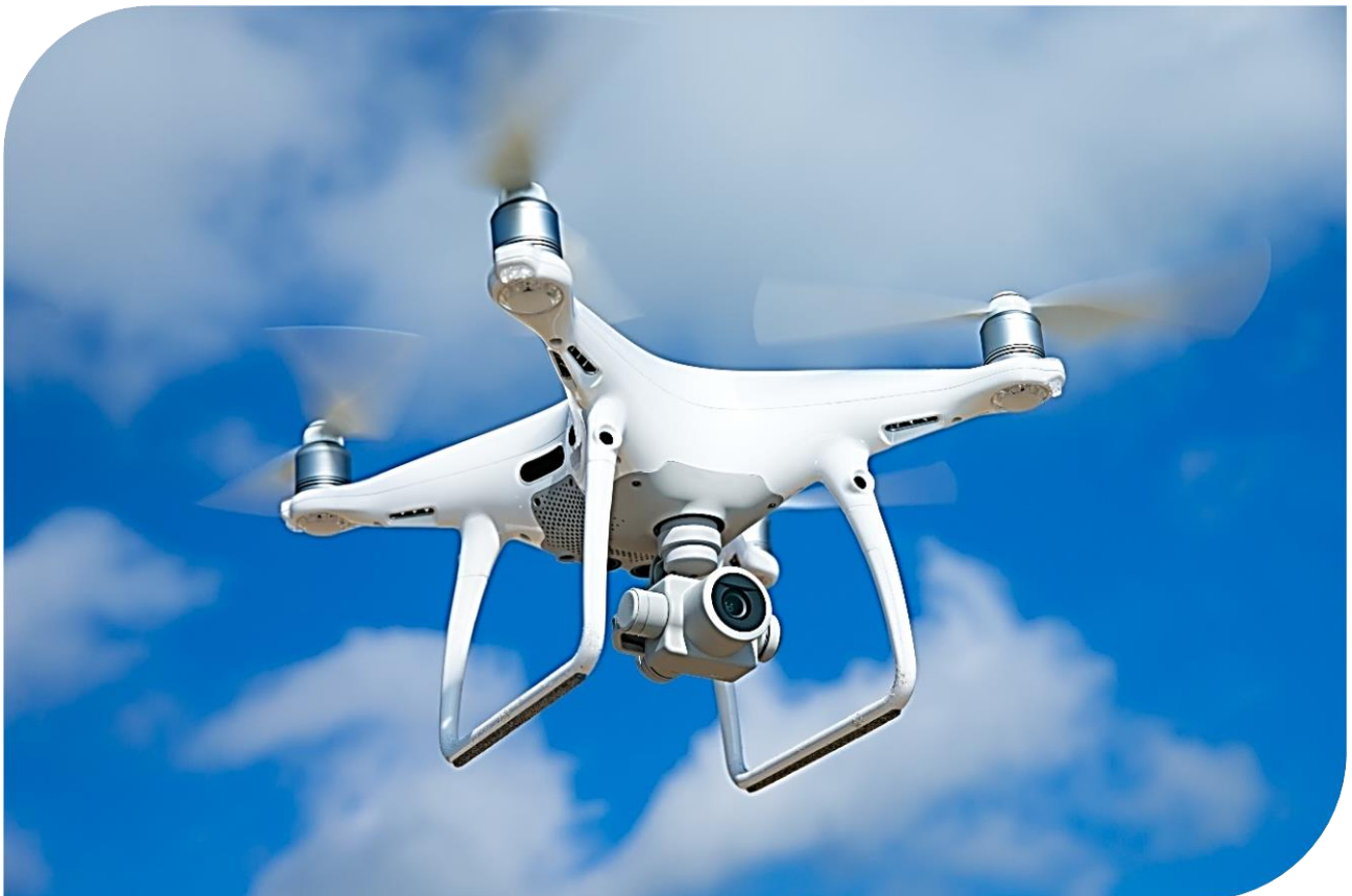
A drone equipped with a camera.

The drone is characterized as a technology platform enabling a limited payload. Different types of drones are available on the market: Fixed-wing drones (similar to known airplanes); drones with several horizontal propellers (multirotor drones that are similar to helicopters); or a hybrid which is a fixed-wing drone that is capable of vertical take-off and landing. The payloads enabled include, e.g., electro-optical, infra-red, and multi/hyperspectral cameras; Radio/Light Detection and Ranging (RADAR/LiDAR); and particle/gas sensors to name a few. Drones are controlled remotely by an operator, but the longer-term perspective is autonomous flight. However, seen from a Danish perspective, this requires substantial development related to failsafe software, communications and control equipment, and sense and avoid technology. These are technology development tasks related to the FreeD project.