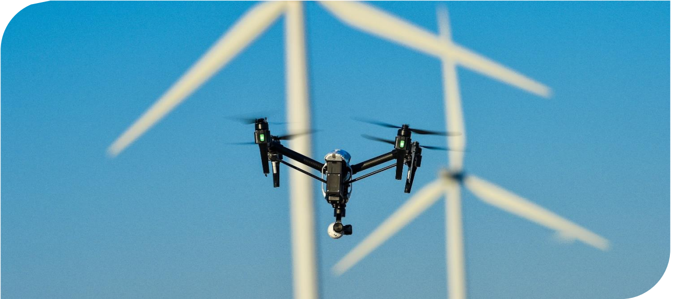
A drone on a wind turbine blade inspection mission.

Both providers (e.g., Creative Sight and Drone Solutions Denmark) and the customer side believe there is an immediate business case in applying drone technology for blade inspection. The use of drones enables better picture quality and lowers the downtime of the wind turbines. Moreover, less man hours are needed to do the inspections. However, it is particularly a more intelligent use of data including picture recognition and damage categorization that allows better design and financial decisions that the customers are looking for.