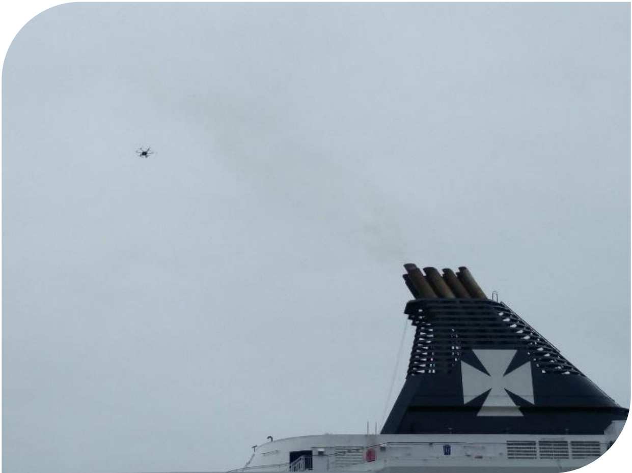
A drone positioned behind a ship's exhaust plume.

Explicit would like to start flying drones in Danish territory. Normally, this should not pose a problem as long as the drone stays under 150 meters above sea level. To measure the sulfur emission behind ships, the drone would only have to fly between 25-50 meters above sea level. However, e.g., the Great Belt is a low-flying zone available to the Danish Defence, and it is occasionally used for reconnaissance missions where fighter planes fly low to, e.g., take pictures with the purpose of spotting what is onboard ships. The Defence does not have to inform anyone before flying. This makes it difficult to plan drone missions over