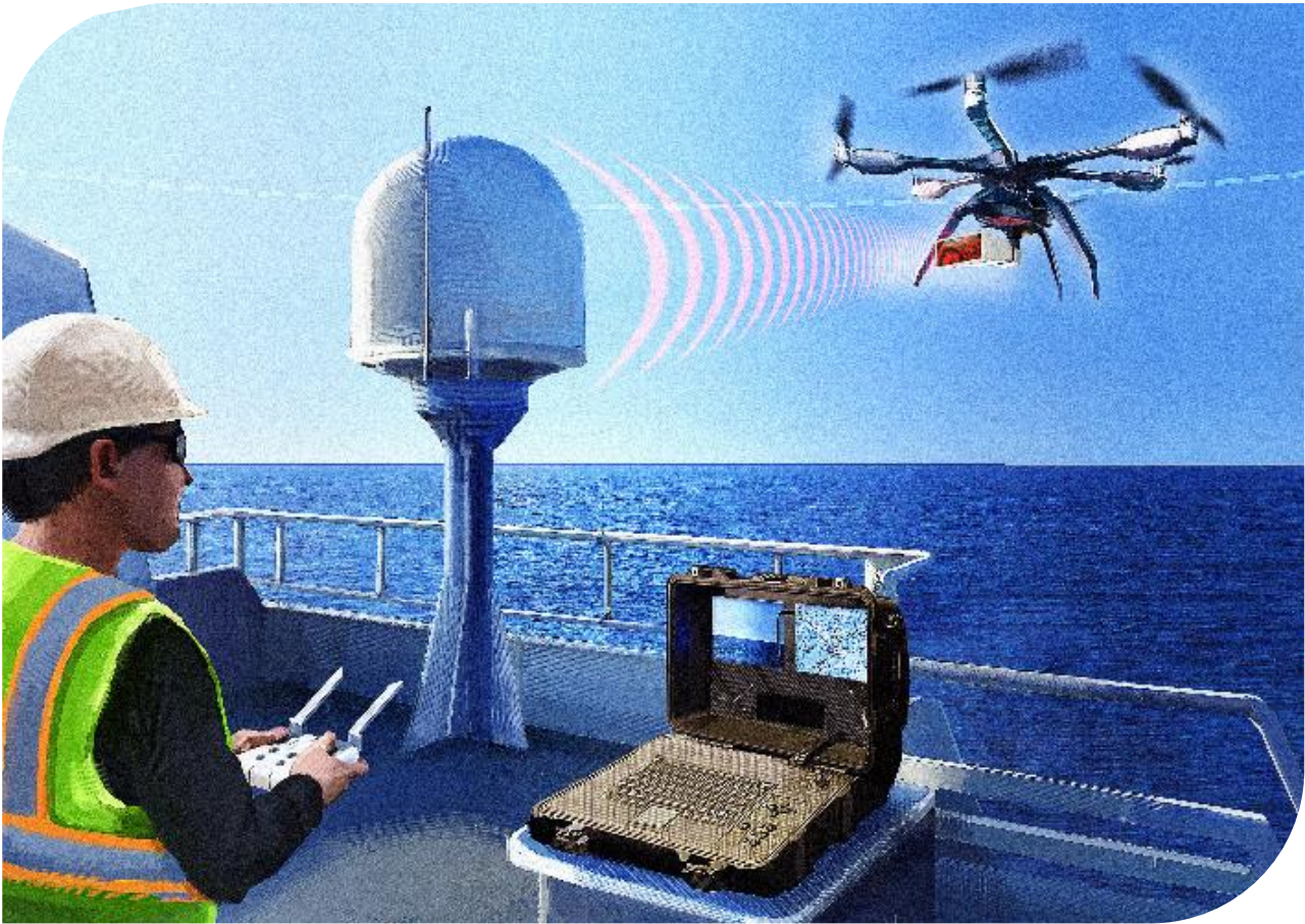
Illustration of QuadSAT's drone solution for testing ships' satellite communication systems.

The aim is to have a 100% first time fix rate, and QuadSAT has estimated the flight time to be around 15 minutes per mission. Battery lifetime is therefore not a barrier to the implementation of a drone solution, since a multirotor type of drone can easily do the job. However, there are still some obstacles to overcome before QuadSAT can implement their drone solution: