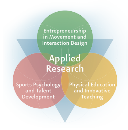
Figure 1. The three research areas in the research unit Learning & Talent in Sport

Third, with the University of Southern Denmark's increasing emphasis on innovation and entrepreneurship, LET'S is encouraging new ways of thinking and learning through its research in entrepreneurship education for practitioners involved in human movement. Inside that a major research interest is "Human Movement Computer Interaction" which seeks to obtain an understanding of the human who moves and learns through interaction with computers and at the same time study the design process of developing such concepts.