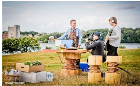
Fig 5 and 6: Visual presentations of furniture from www.woodn wonder.com , Woodn wonder 2016b