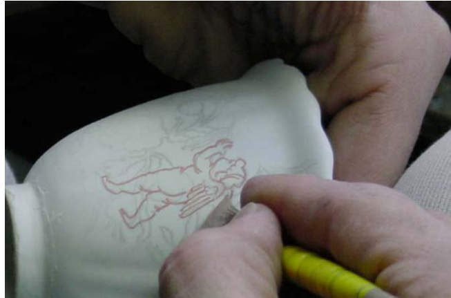
Left: Ill. 1, Royal Tichelaar Makkum/Studio Makkink & Bey: ‘35 minutes cake saucer.’ Right: Ill. 2, Illustration from Studio Makkink & Bey’s list of projects. This illustration represents a form of double mediation. The process of making is mediated both onto the product itself and as image to illustrate the point of the project.