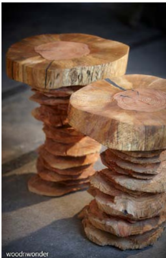
Fig. 4: Bente Hovendal: Coffee table/side table. The close up perspective brings attention to the cracks and marks on the objects.

Natural shapes stick out from the form, there may be cracks in the surfaces and traces of the use of the chainsaw. Every quirk becomes a part of the design and a wonder within the whole form. (Woodnwonder 2016a)