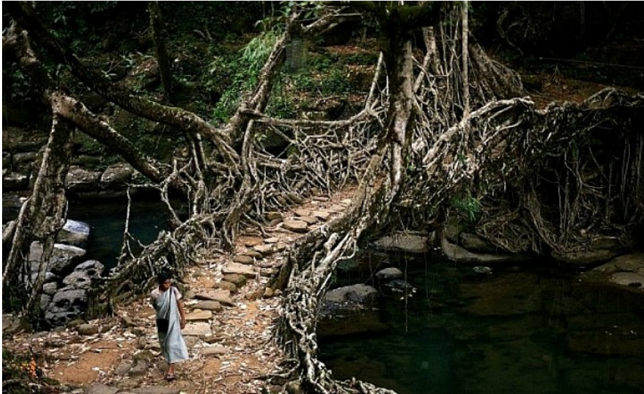
Ill. 4: Living root bridge, Cherrapunji, India, Source: Farmer 2009

There is thus obvious similarities in the techniques and design strategy. The difference is, however, that as traditional cultural products the bridges have no recognisable maker and they are not considered as statements but rather as expressions of the culture of the Khasi tribe that make them. In the modern context, on the other side, the grown chair can be considered as an extremely inefficient way to solve its functional task and this irrationality becomes the very point of the object.