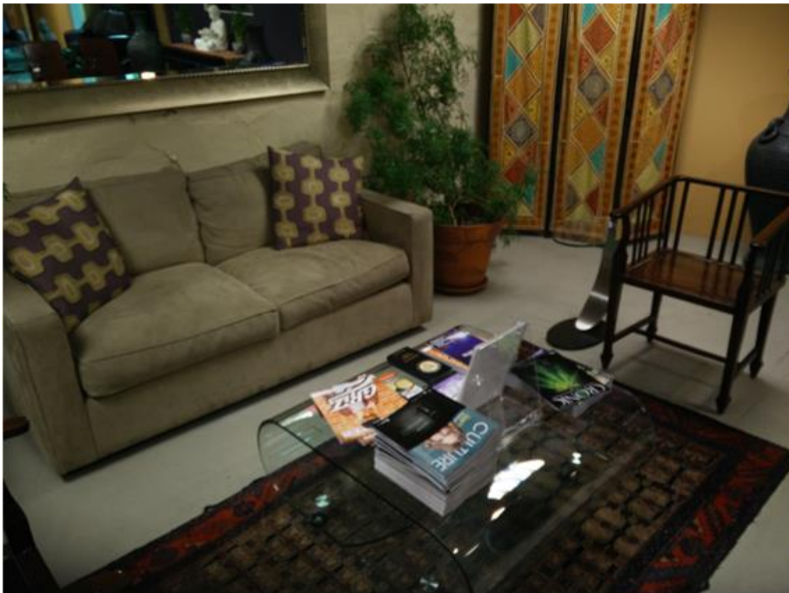
Figure 1. Typical waiting area including promotional literature.