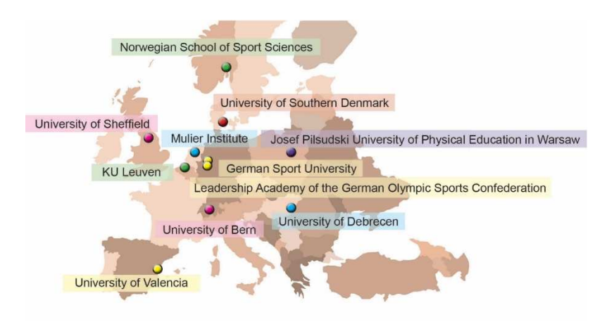
Figure 1. SIVSCE partnership