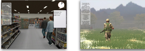
(a) Sound of ventilator blowing overhead. (b) Sound of wind blowing. (c) Man walking angrily toward player. (d) Afghan running toward player. (e) Man staring at player. (f) Wounded soldier staring at player.