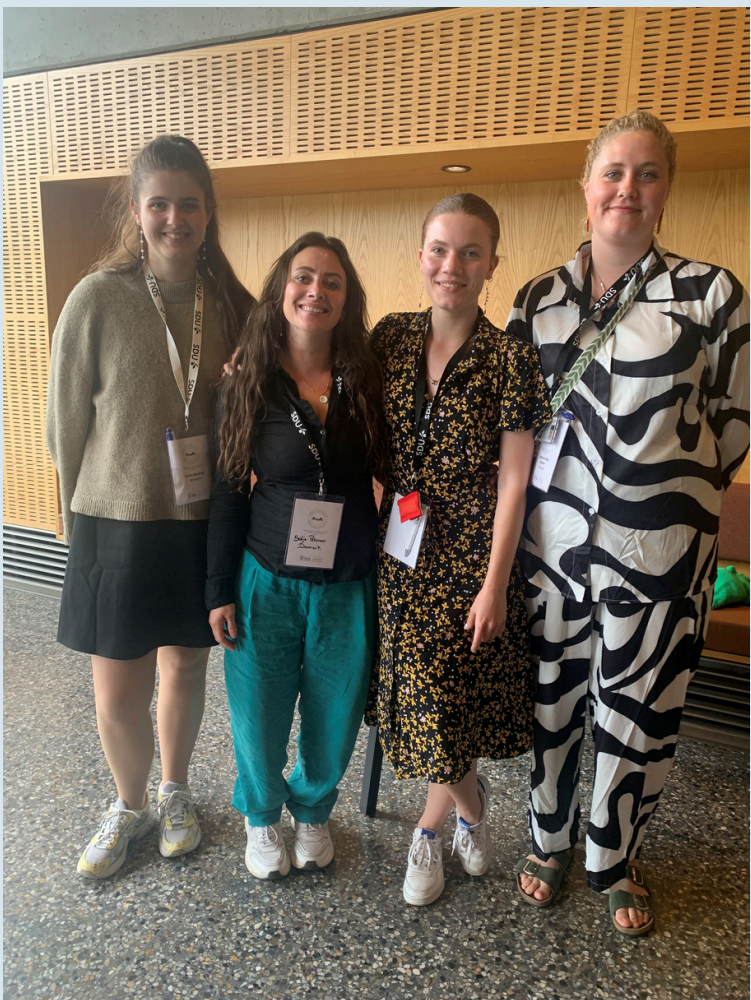
The student helpers.