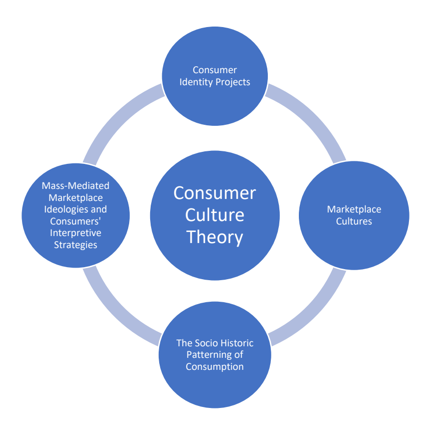
Source: Own illustration based on Consumer Culture Theory (CCT): Twenty Years of Research by Arnould & Thompson, 2005. Journal of Consumer Research, 31 (4), 868-882.

Consumer identity projects are considered "the co-constructive co-productive ways in which consumers (...) forge a coherent if diversified and often fragmented sense of self" (Belk, 1988; McCracken, 1986; Arnould & Thompson, 2005: 871). Therefore, the consumer is an identity seeker and active constructor, expressing a sense of self through consumption, drawing on resources that are offered by the market. Consumer identity projects are typically considered to be goal driven (Mick & Buhl, 1992; Schau & Gilly, 2003; Arnould & Thompson, 2005), however, the sense of self that consumers acquire are not coherent, because within postmodernism, the fragmentation and diversification of consumer identities is of interest of consumer culture researchers, including "internal contradiction, ambivalence and even pathology" (O'Guinn & Faber, 1989; Hirschmann, 1992; Thompson, 1996; Otnes et al., 1997; Mick & Fournier, 1998; Murray, 2002; Arnould & Thompson, 2005: 871). The markets from which consumers actively draw to engage in identity projects is a source of mythic and symbolic resources that produce different consumer types that people can choose to inhabit and construct narratives of identity (Levy, 1981; Belk, 1988; Hill & Stamley, 1990; Arnould & Thompson, 2005).