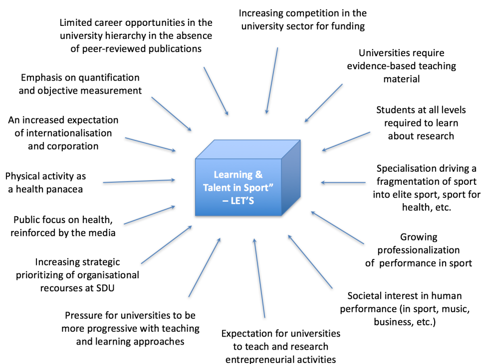
Figure 2. Key contextual factors considered when developing LET'S strategy

We have identified some key factors in our operating environment that influence LET'S strategy development and implementation (see Figure 2).