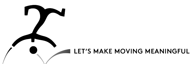
Figure 2, The logo and slogan of LET'S