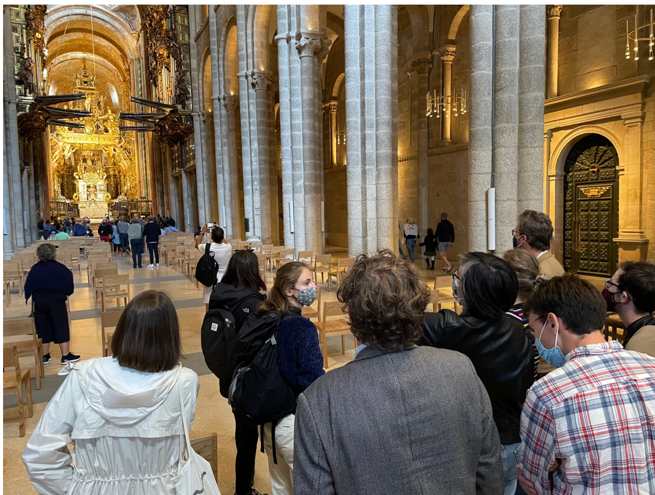
CML annual gathering 2021, Santiago de Compostela Cathedral