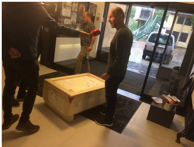
Image 2: The manuscript arrives at the Montergården Museum, Odense