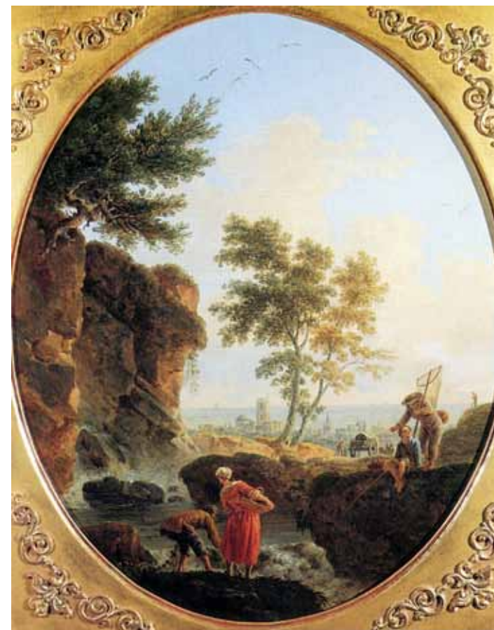
Fig. 1: Joseph Vernet, La Source abondante , 1767, private collection.

A ma droite, dans le lointain, une montagne élevoit son sommet vers la nue. Dans cet instant, le hasard y avait arrêté un voyageur debout et tranquille. Le bas de cette montagne nous était dérobé par la masse interposée d'un rocher. (...) L'espace compris entre les rochers au torrent, la chaussée rocailleuse et les montagnes de la gauche formaient un lac sur les bords duquel nous nous promenions. C'est de là que nous contemplions toute cette scène merveilleuse. Cependant il s'était élevé, vers la partie du ciel qu'on apercevait entre la touffe des arbres de