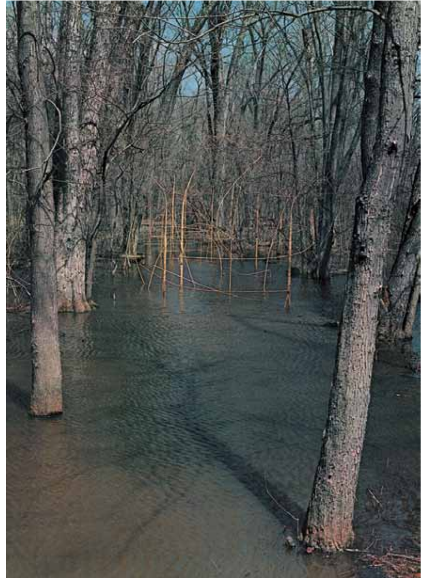
Fig. 8: Michael Singer, First Gate Ritual Series 4/79 , 1979, was once placed in De Weese Park, City Beautiful Council, Dayton, Ohio.

Already in the 1950s, a number of artists had decided to replace the paintbrush or chisel with the human body. So we have the French artist Yves Klein (1928-1962), who became famous for his Blue Monochrome pictures, which visualise the cosmos. The 'brushes' that he used were usually women who were covered in paint – preferably blue – before they pressed themselves against the canvas, thereby creating a variety of pictures, for example, the four so-called Anthropométries . Only one of the pictures has a title. It is called Hiroshima . 19 The artist has described it like this: "elles (mes modèles) se sont ruées dans la couleur et, avec leur corps, ont peint