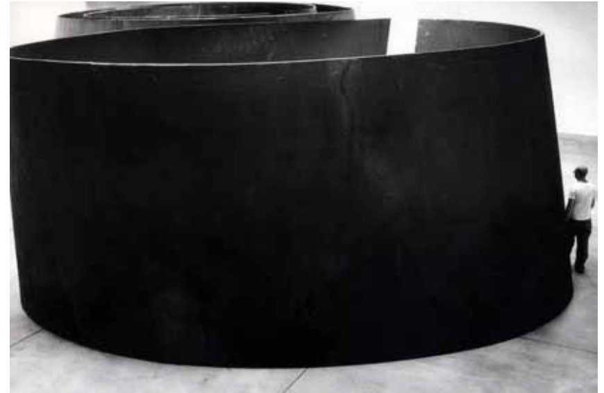
Fig. 7: Richard Serra, Double Torqued Ellipses IV, 1999. Installation view of the exhibition Richard Serra Forty Years, MOMA, New York, June 3, 2007 through September 10, 2007.

As you walk in these, in Double Torqued Ellipse especially, your body responds to things your eyes are not yet even seeing. You