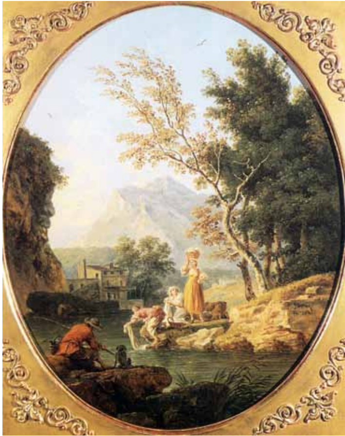
Fig. 2: Joseph Vernet, Les Occupations du rivage , 1767, private collection.

In connection with "the poetic transformation" of Vernet's painting, Occupations du rivage (1767) (Fig. 2), into a story about a stroll in a landscape, we see again that – as Professor Anne Fastrup points out, "it is the perceiving and moving body that makes it possible to experience the surrounding world" (Fastrup 2007: 130). 8