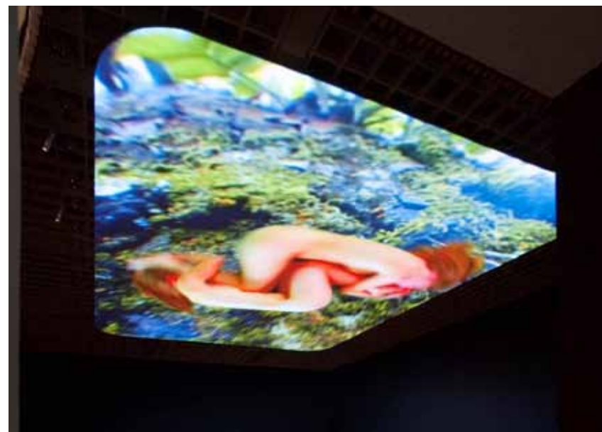
Fig. 9: Pipilotti Rist. Homo sapiens sapiens , 2005, shown at the exhibition, The World is Yours , Louisiana Museum of Modern Art.

All the visual artists who I have mentioned follow thinking Merleau-Ponty's thinking in their work; that is, the viewer senses himself situ-