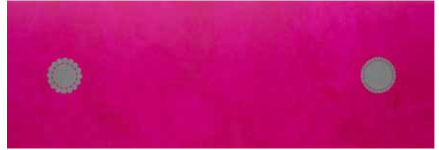
Fig. 4: Dorte Dahlin, Lost Distance , 2004. Oil and iron powder on canvas. 140 x 450 cm. Private collection.

not least the colour – electric magenta – and the brushwork that affects the body. The precisely formed circles almost function like a pulse beat; an effect that is reinforced by the colour of the steel powder. I chose the format of the picture in order to show the infinite number of vanishing points in a space, in which you can physically lose yourself while your eyes try to keep hold of the circles. 12