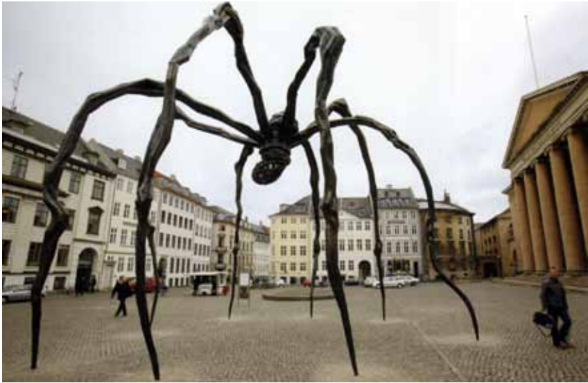
Fig. 5: Louise Bourgeois, Maman (1999) exhibited in 2003 in Nytorv (a square) in Copenhagen.

large works in the public space, for example, Maman (1999) (Fig. 5). 13 In both cases the viewer is drawn into her magical sphere of art, and is stimulated to experience it with the entire body and all its senses; it is essential to constantly move around her sculpture in order not to miss any of the many aspects contained within it.