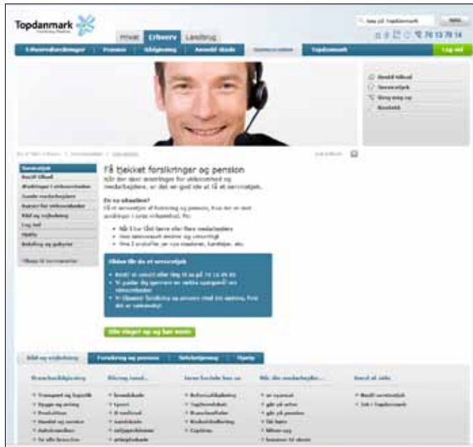
Figure 3: Screen print from Topdanmark's web page Servicetjek