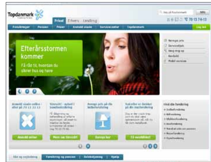
Figure 4: Topdanmark's home page with a header about storm damage

Clicking on the header makes a new web page appear that, in the main content column, spells out how to take precautionary measures against a storm and bad weather. On this new web page, the body text of the main content column is arranged in six paragraphs, including six bullet points. In the middle of the body text there is a green text box with the text: "Er skaden sket? Få hjælp her" (Has the damage been done? Get help here). The text box is a hyperlink which guides the customer to a web page with information on how to contact the insurance company (see Figure 5). 7