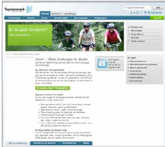
Figure 5: Topdanmark's web page about Storm damage