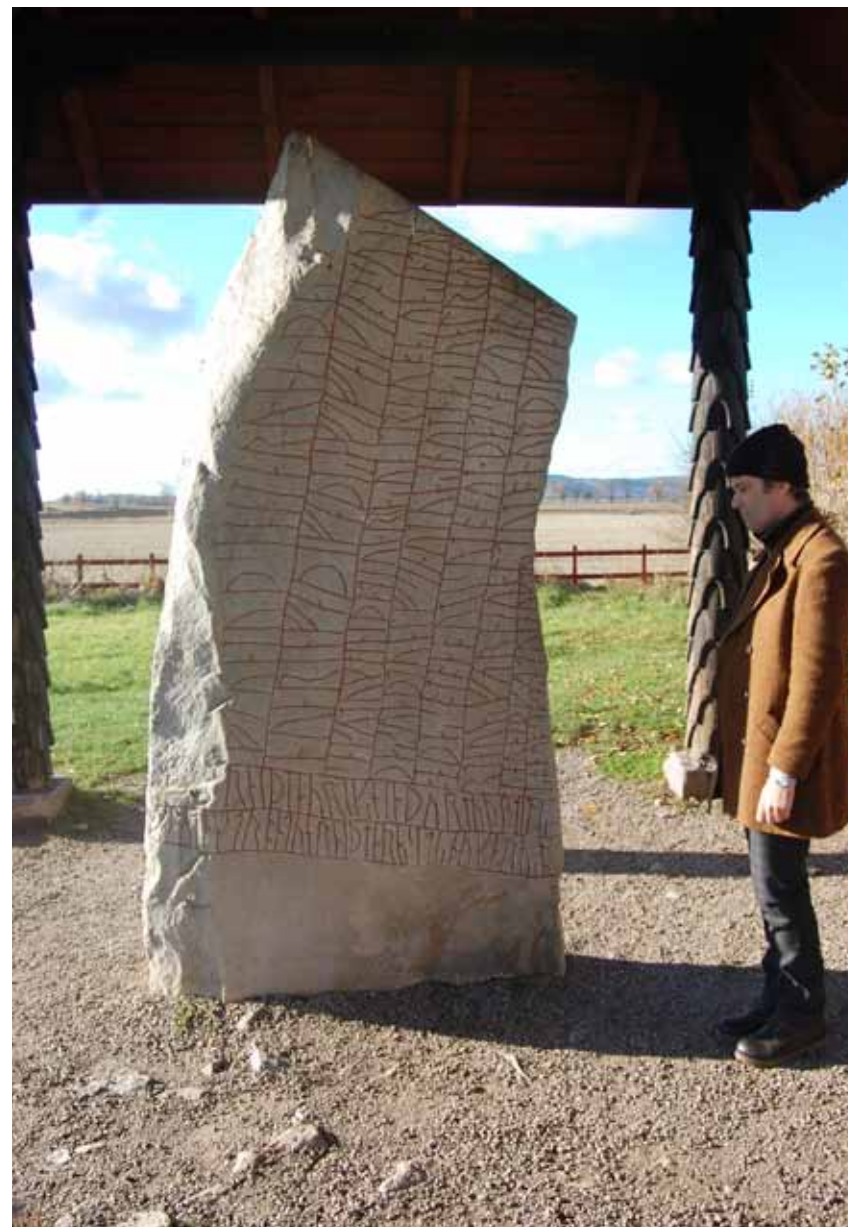
Picture 1: The Roek Stone: (front view).

We know next to nothing about the role of rune stones in the literacy practice of the Viking age, except for what can be understood from the meaning of the inscriptions. But we do know that the rune stones were typically raised in connection with roads, sometimes as a part of the construction of the road itself, of a bridge or an embankment. This means that the road, the stone monument and the writing, taken together, had a great impact on anyone who