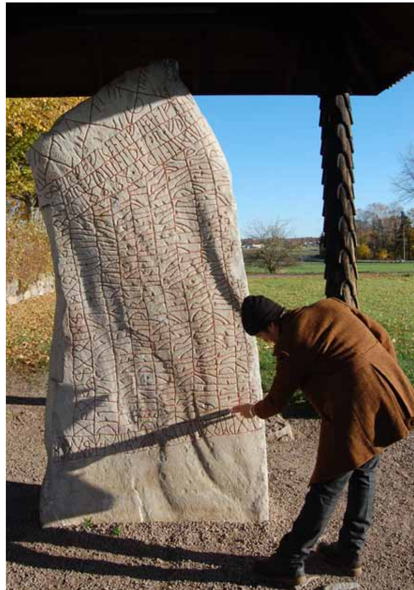
Picture 2: Reading the back side of the Roek Stone.

With the reader placed in a position where the runes become readable, the stone has circumscribed the reader's freedom of movement for the time needed for the reading. This is most obvious in case where the inscribed text is long and difficult to decode, or if it covers more than one side of the rock, or if the text is ordered in other ways than in straight horizontal rows. All these three circumstances are relevant in encountering the Roek Stone. Its inscription is both long and difficult: it consists of more than 700 characters, two different alphabets are used, and four different kinds of cypher occur in the latter part of the text. The inscription covers all of its five sides: front and back, the two end sides, and the top. The dominating ordering principle of the inscription is that of vertical columns with characters tilted ninety degrees. These three traits of textual organization can be understood as conditions that regulate the reader's body movements. When reading the inscription, the reader is obliged to stay in close proximity to the stone for a fairly long time, to move around the stone, and – in order to follow the text through its vertical columns – to repeatedly bow down in front of the stone (see Picture 2).