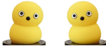
Figure 2: The two Keepon robots taking turns asking questions

Danish participants ( N=52 ; \chi^2=3.24 ; p=0.777 ). Post-hoc analyses show that Germans find the robot with Danish intonation dominant, while the Danish participants tend to perceive the robot with German intonation as formal ( p=0.06 ).