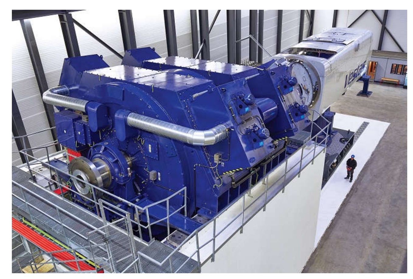
Figure 2: Function Test Bench installation at LORC, a Vestas turbine can be seen installed on the test bench.