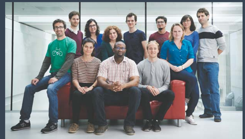
Previous EDSD students now working at MaxO