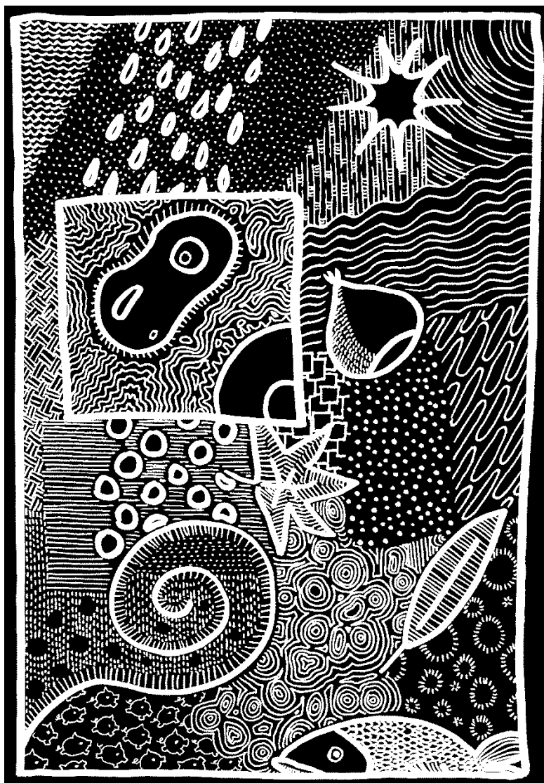
by Eugenio del Nobile

The way you remember your own life is often not the way other people would say it really happened, but those memories are yours, and there's a difference between lying about yourself and representing yourself in a way that feels true to you.