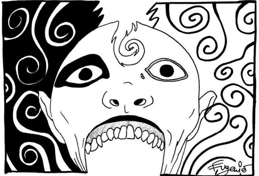
by Eugenio del Nobile