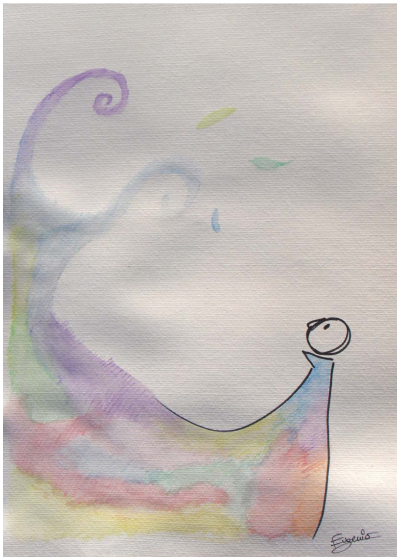
by Eugenio del Nobile

There's a little truth behind every just kidding, a little curiosity behind every just wondering, a little knowledge behind every I don't know, and a little emotion behind every I don't care.