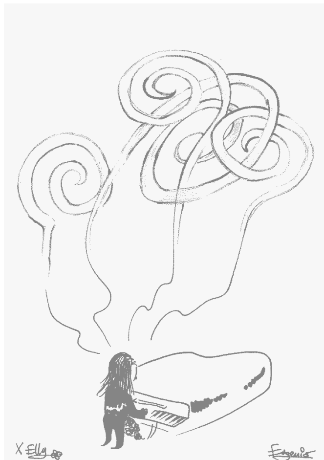
by Eugenio del Nobile