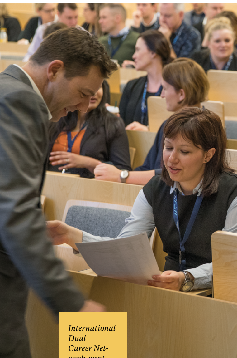
International Dual Career Net- work event, January 2017