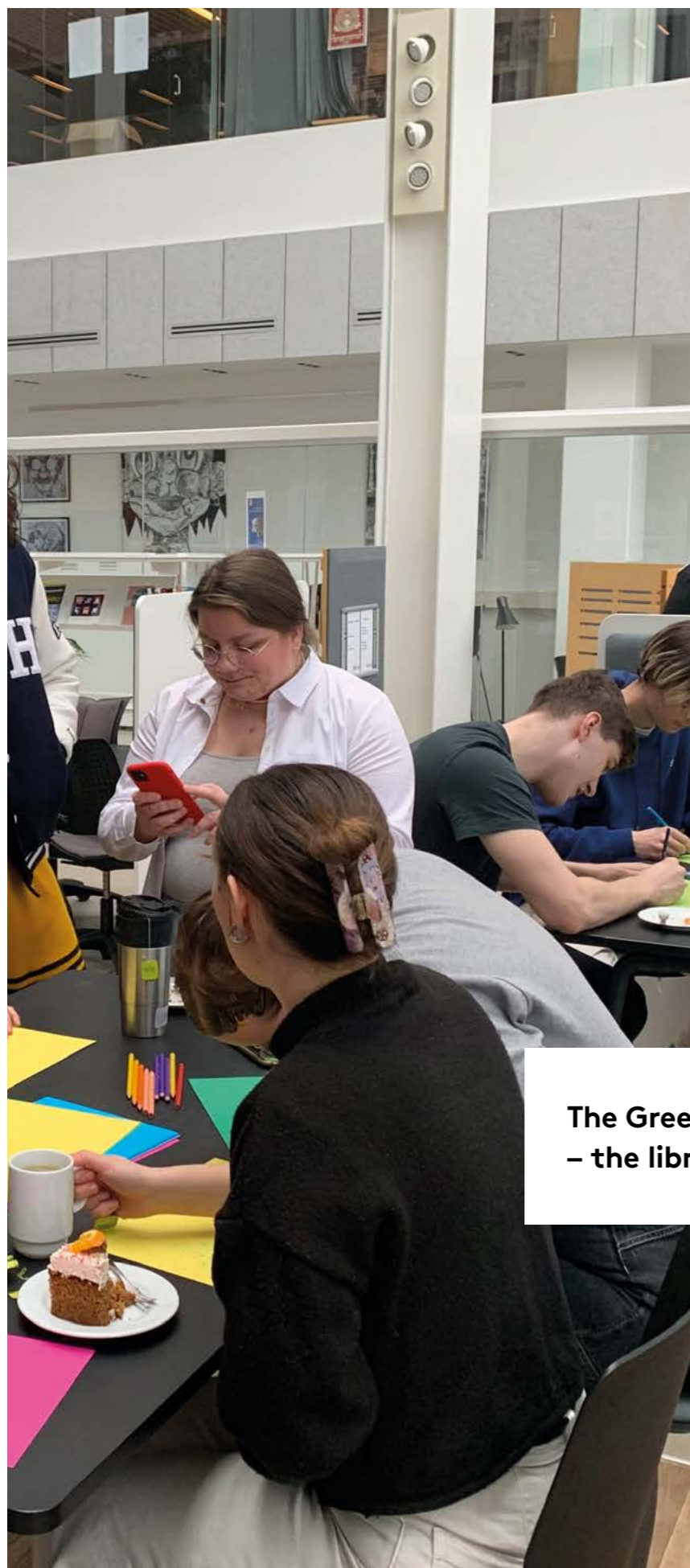
The Green Corner – the library in Sønderborg