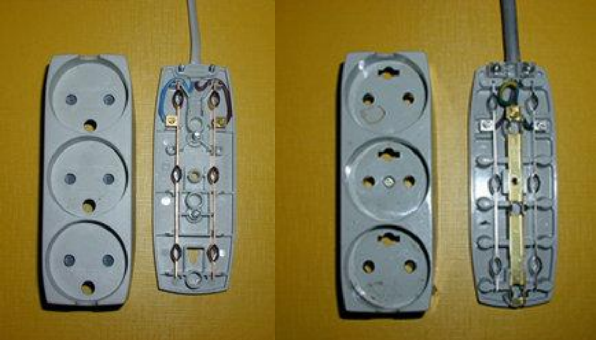
Power strip without earth

Powes strips without earth, in which plugs with earth can be inserted, must not be applied at IMB.