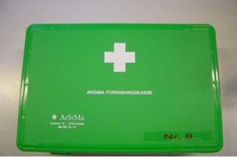
First aid kits contain:

For minor damages: disinfection napkins, band aid roll, small compress dressing, band aids, fingertip band aids and dederon bandage.